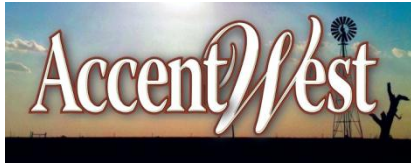
Accent West Magazine