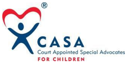
Amarillo Area CASA